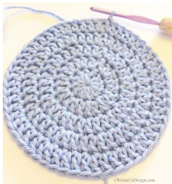
INCREASES THROUGH RD 5

Rnd 4: Ch 3 & DC in same st, *{1 DC in next st, 1 DC in next st, 2 DC in next st} rep from * until end, join with a sl st to 3rd ch. (44 sts) Stop increasing here for 0-3 mos + 3-6 mos, go to Hat Sides .