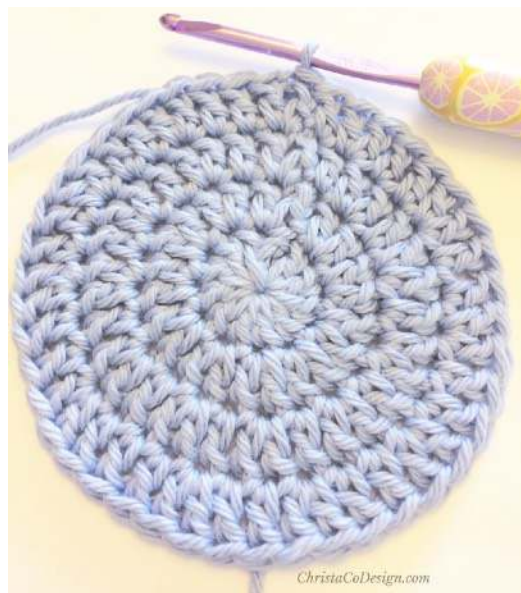
INCREASES THROUGH RD 4

Rnd 3: Ch 3 & DC in same stitch, DC in next st, *{2 DC in next st, 1 DC in next st} rep from * until end of rnd, join with a sl st to 3rd ch. (33 sts)